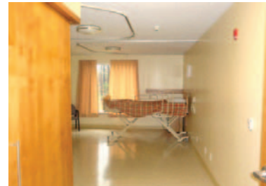
For more information about SalDan visit www.saldan.net .